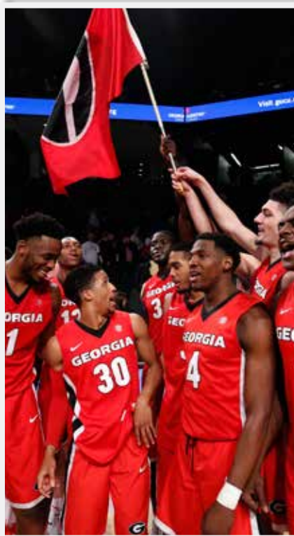
Georgia's 17-point victory at Ga. Tech was the Dogs' second-largest road margin ever over GT, second only to a 69-13 win in 1909.